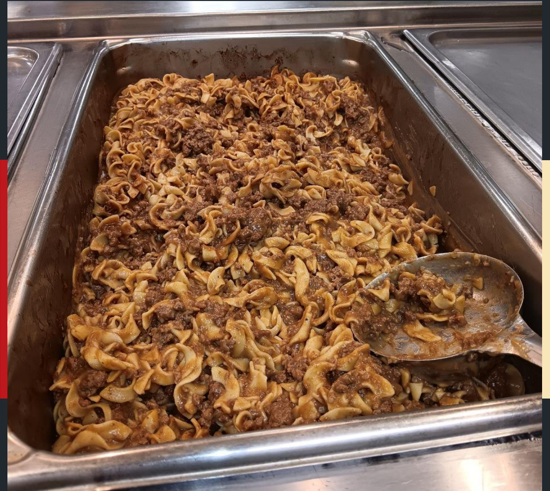
Boyd ISD-Davis 20 Beef