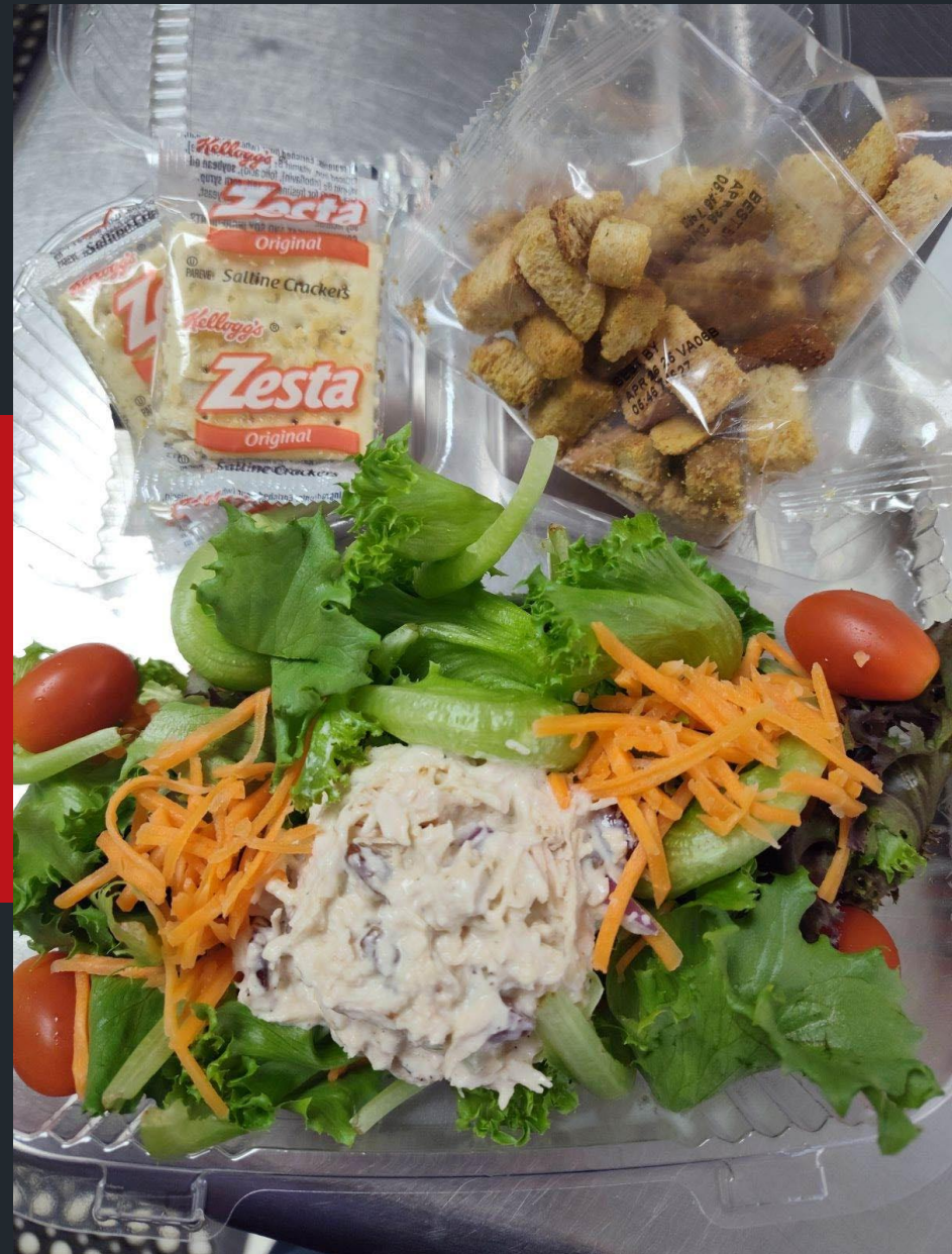
Florence ISD – True Harvest via Labatt