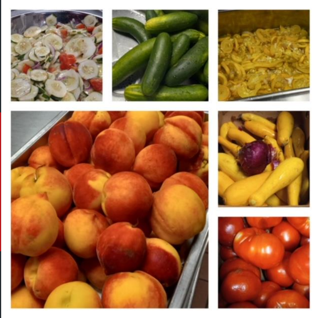
Jefferson ISD– Produce from McCurry Produce